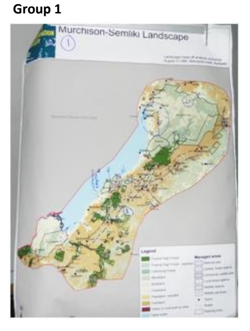
Figure 2. The two different land use forecast maps generated by the two groups.

Once this was completed, the two groups were asked to draw on large A0 maps of the landscape all the future activities they believed were going to occur in landscape during the next 10 years. The groups identified likely areas for urban and agricultural expansion, new development projects, and infrastructure required to support the landscape of the future (Figure 1). A representative of each group then presented the group's projections to the plenary for discussion. The outcome was a much clearer picture of what the future development patterns are likely to look like in the landscape.