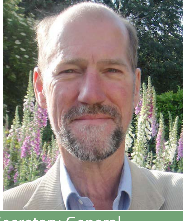
Secretary General Alliance of Religions & Conservation