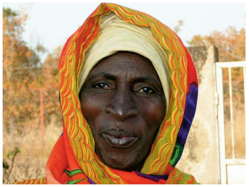
\ensuremath{\mathbb{C}} TV Boy via Creative Commons