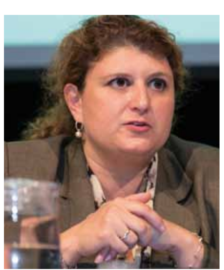
Carol Chouchani Cherfane, United Nations Economic and Social Commission for Western Asia

"We are looking to set up a regional knowledge hub where all the outputs of the climate modelling and vulnerability assessment outcomes will be available for researchers in the region to carry out other climate modelling exercises and support climate change adaptation policy," said Carol Chouchani Cherfane of the United Nations Economic and Social Commission for Western Asia (ESCWA). "People have done quite a lot of climate modelling in the region but at a country