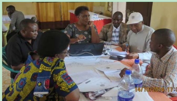
The Steering Committee members discussing the strategic plan for the GGMKEs in Kasulu.

The structure, composition and roles of the GGMKECTT are outlined in the sections below.