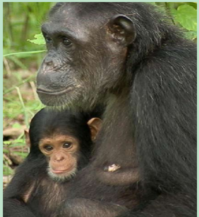
A mother chimpanzee ( Pan troglodytes ) with its baby in the GGMKE.

Administratively, the GGMKEs falls in two political regions of Katavi and Kigoma and therefore cooperation between the two regions, their districts and other stakeholders working in the ecosystems is critical for successful implementation of any conservation and development plans in the ecosystems.