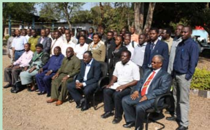
Some of Senior Government and NGOs officials who attended the launch of the GGMKEs Steering in Mpanda town –August 2013

Program) collaborated with the Jane Goodall Institute and the four districts located in the GGMKEs to form the Greater Gombe-Mahale-Katavi Ecosystems Conservation Technical Team (GGMKECTT) or simply known as “ Steering Committee ” in August 2013 in order to coordinate and advance sustainable conservation activities in the areas.