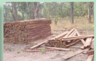
New trunk roads in forested area have improved access to forest resources such as timber, fuelwood and charcoal

For more information contact Chairperson GGMK Steering Committee P.O.BOX 332, Kigoma