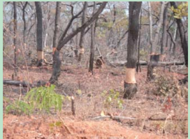
Illegal settlements in the forested areas are main cause of forest clearance through various ways including debarking