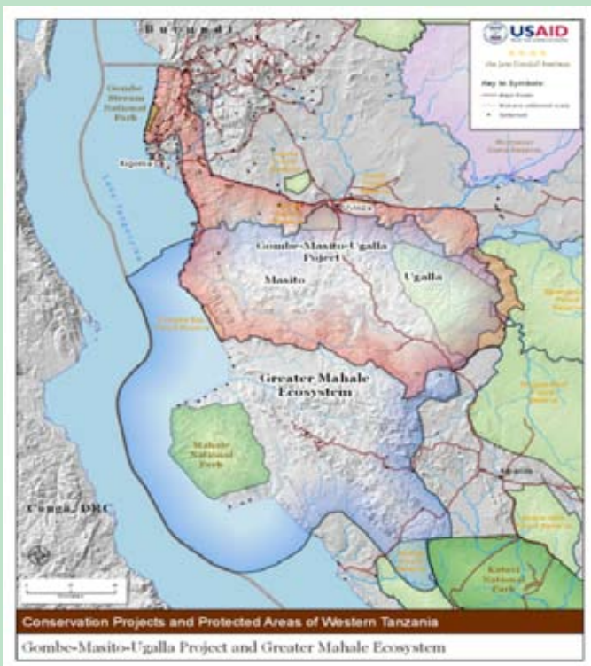
Map of the Greater-Gombe-Mahale ecosystems and portion of Katavi ecosystem.

The Greater Gombe, Mahale and Katavi Ecosystems (GGMKEs) found in Western Tanzania are important habitats which provide a diverse range of ecosystem services that sustain the livelihoods of millions of people living in the ecosystems and beyond. The ecosystems also harbor an incredibly high biodiversity species of fauna and flora including the chimpanzees ( Pan troglodytes ) and elephants ( Loxodonta africana ) – which are one of the flagship species for Western Tanzania.