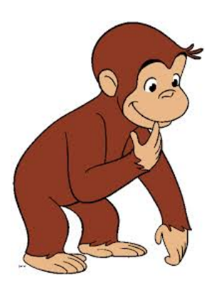
Figure 2: Curious George

Researchers need to have various skills in order to be able to undertake qualitative research that yields rich, explanatory data. Perhaps most important is the need to be curious, and constantly question what you find out. Imagine yourself as the children's character "Curious George" (figure 2), or recall what it was like when you were a toddler and always questioning everything. To be a good qualitative researcher you need to show curiosity and continually ask the question "why?" in order to get beyond a superficial level and really investigate why people perceive things in the way that they do.