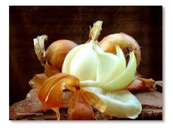
Figure 4: Qualitative research requires asking many questions to get to the root of an issue, and is therefore like peeling back the layers of onion