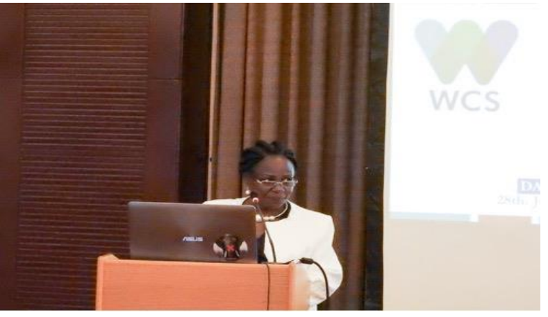
The Hon. Dr. Goretti Kimono Kitutu, Uganda's State Minister for Water and Environment delivering her inaugural speech at the workshop.

The workshop was inaugurated by the Hon. Dr. Goretti Kimono Kitutu, Uganda's State Minister for Water and Environment. She reiterated the government's commitment to support all efforts that promote biodiversity conservation and ensure sustained life for ourselves and future generations including the development of a legal, policy and institution frameworks. The minster stressed the importance of biodiversity conservation and the need to minimize threats to wildlife conservation. She also spoke about the ongoing review of environment