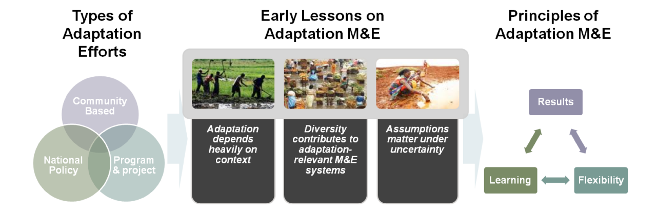
Chapter 3: Steps and Options: Developing M&E Systems

The bulk of the report presents a comprehensive six-step process to develop adaptation-relevant M&E systems for use in developing countries. Development practitioners can apply these steps either to develop an M&E system for an adaptation project or program, or to identify ways to monitor and evaluate the adaptation components of a development intervention. The steps also can help funders and practitioners to gauge the utility of existing M&E systems for adaptation initiatives.